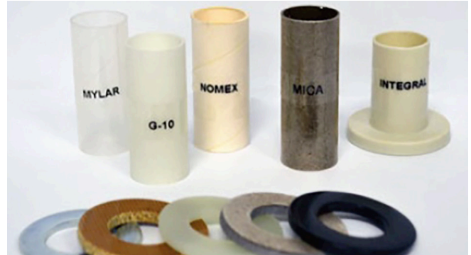
Isolating Sleeves & Washers

The iGuard™ 9000 style isolation gasket is manufactured from 3mm (1/8") thick genuine Durlon® 9000 glass filled PTFE gasket material to improve sealability in critical service chemical environments from pH 0-14 and other aggressive media to 260°C(500°F). This design makes the iGuard™ 9000 ideal for cryogenic, petrochemical, pharmaceutical, semiconductor manufacturing, and food and beverage manufacturing applications in ANSI Class 150 and 300 or international equivalents. Sizes available: from NPS 1/2" (DN 25) to NPS 144" (DN 3600) in Type E (Full Face) or Type F (Raised Face) configurations. This kit comes standard with one iGuard™ 9000 gasket, two isolating PTFE washers, two SAE zinc plated steel backup washers, and one PTFE sleeve tube for every bolt/stud. Maximum pressure class - 300# ANSI.