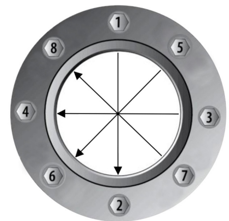
Star Pattern Diagram

NOTE: Flanges are not included in the kit. Contact our Technical Department for more information about Installation, Bolt Torquing, the Star Patterns, and Load Values: tech@durlon.com