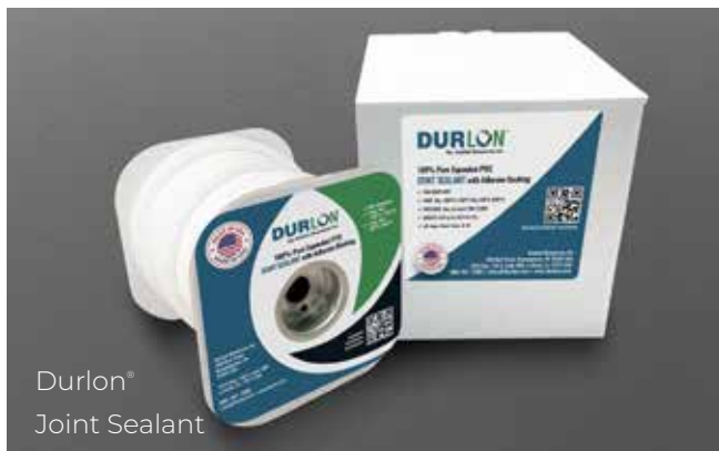
Durlon® Joint Sealant