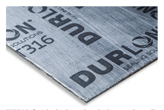
FGT316: Standard industrial grade sheet mechanically bonded on both sides of a 0.004" thick 316 stainless steel tang core. This product is used where stresses and pressures are high and improved handling is important.