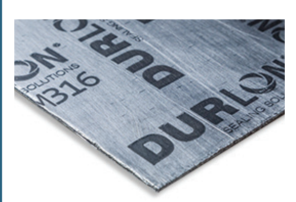
FGM316: Inhibited grade sheet laminated with multiple layers of 0.004" thick 316 stainless steel foil core. This product is used in applications with high mechanical stress or pressure, above average burst resistance, exceptional rigidity, and suitable to cut gaskets with narrow strips.