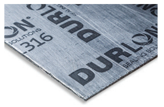
FGL316: Standard industrial grade sheet laminated with an adhesive bond on both sides of a 0.002" thick 316 stainless steel foil core. This product is used where high performance and handling are important.